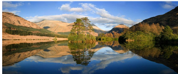
Lochan Urr, Glen Etive, Highlands